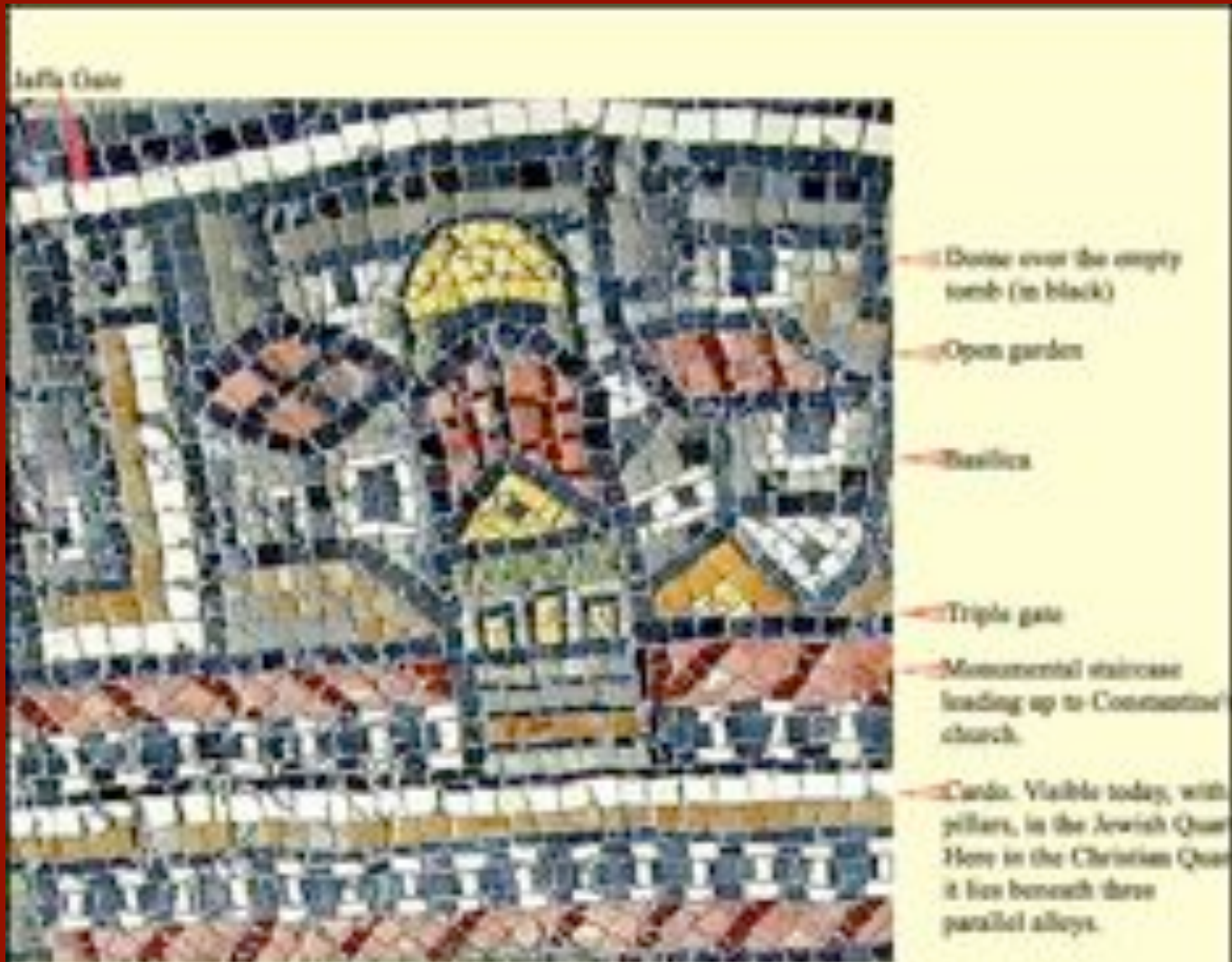
Constantine's Church of the Resurrection (Holy Sepulchre), as portrayed in a 6th-century mosaic on the floor of a church in Madaba, Jordan. (Looking west.)