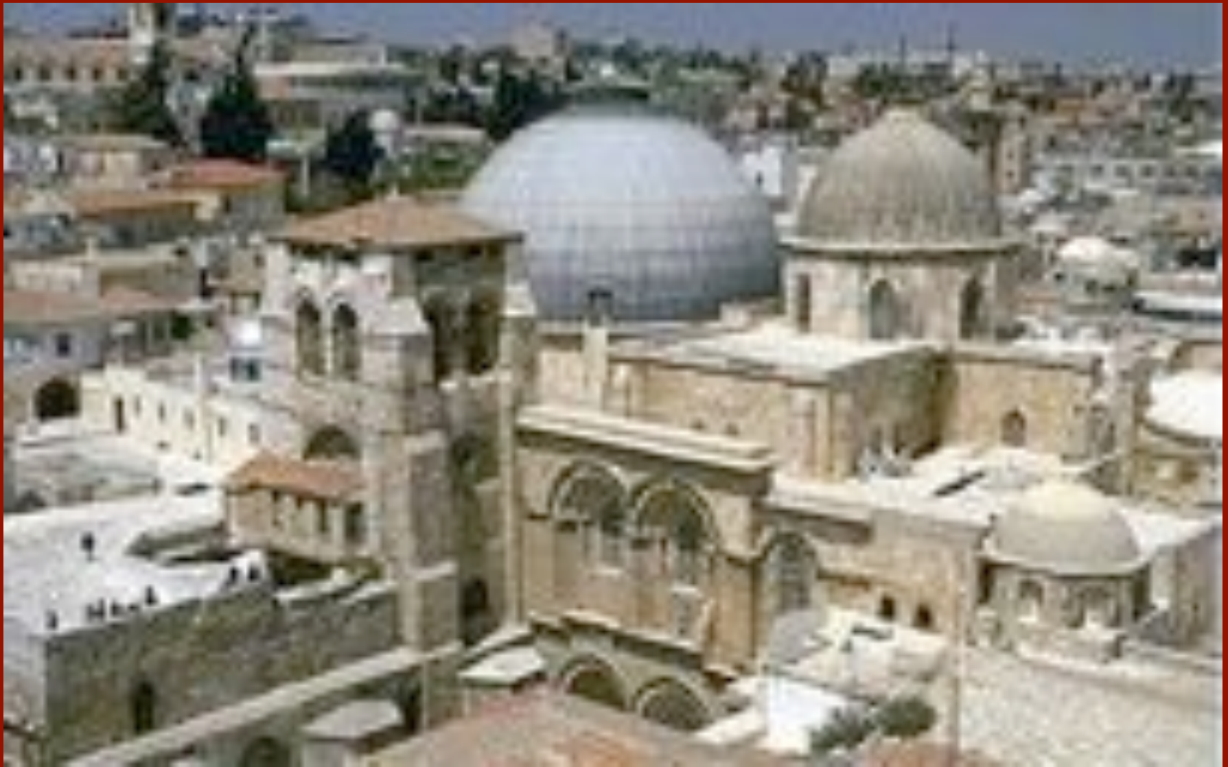
Church of the Holy Sepulchre, Jerusalem