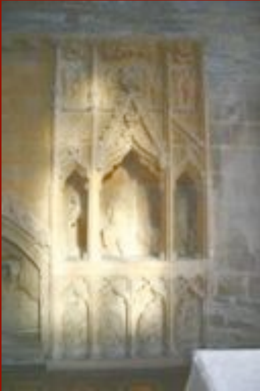
Ester Sepulchre All Saints' Hawton